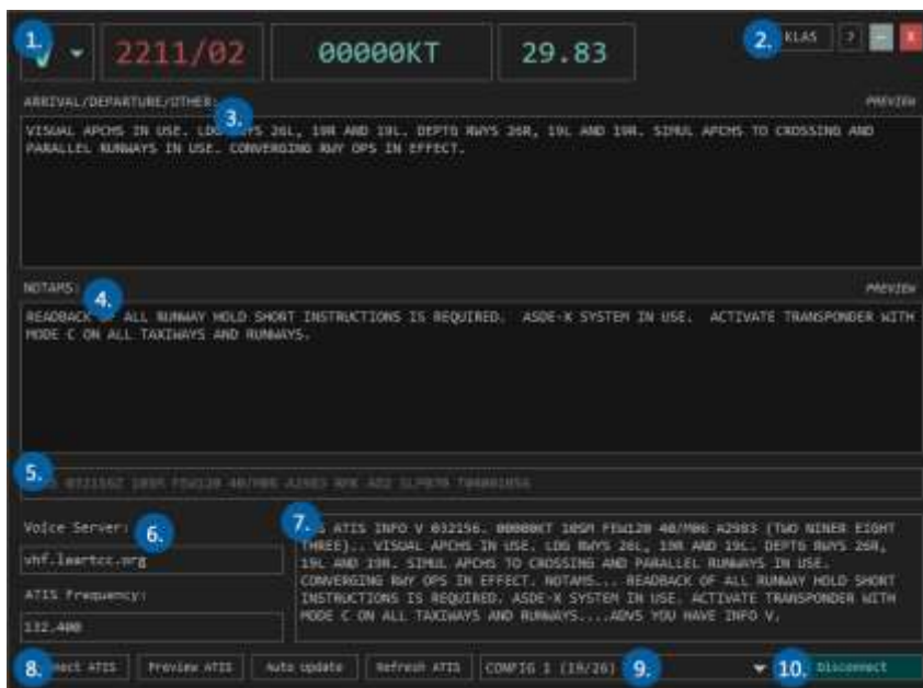
Figure 5.2: Example of a vATIS interface